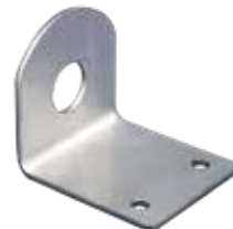
Part No: 4723 ANTENNA MOUNT TO SUIT 15905, 16098