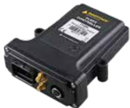
Part No: 11505 SMARTTRACK GLOBAL FLEET CONTROLLER (LTE)

RCT's fleet management system is the best in the market producing detailed automated reports to assist fleet managers and suppliers to continually improve operating KPI's.