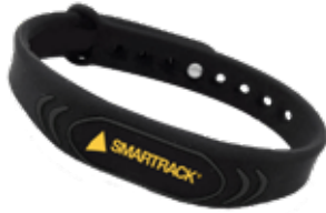
Part No: 16094 SMARTRACK RFID OPERATOR WRISTBAND