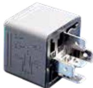
Part No: 9029 RELAY