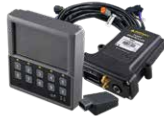
Part No: 16032 KIT GLOBAL WIFI HID VDI 5