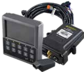
Part No: 15616 KIT GLOBAL LTE, HID DISPLAY, SHORT LOOM, 5M DISPLAY CABLE