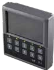
Part No: 15913 SMARTTRACK GLOBAL DISPLAY WITH RFID READER