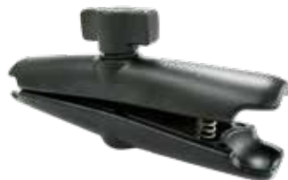
Part No: 8799 RAM DOUBLE SOCKET ARM 6"