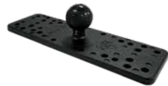
Part No: 8798 RAM BASE 2" X 6" UNIVERSAL RECTANGULAR