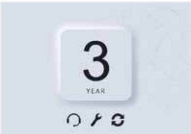
Part No: 12423 SUPPORT/ACCESS 3YR SMARTRACK