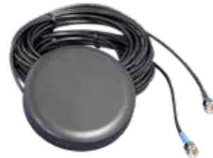
Part No: 15905 ANTENNA DUAL BAND WIFI & GPS