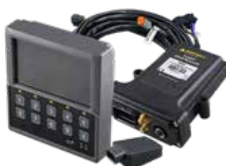
Part No: 16028 KIT GLOBAL 4G RFID VDI 5M 51963088