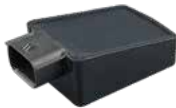
Part No: 13855 SENSOR IMPACT SMARTRACK