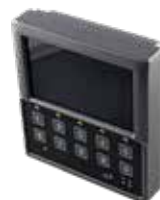
Part No: 15901 RCT DISPLAY WITH HID READER