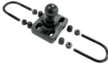
Part No: 8494 RAM BASE DOUBLE U-BOLT FOR RAILS TO 1.25" IN DIAMETER