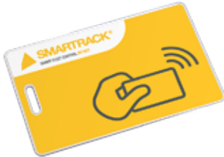
Part No: 15919 SMARTRACK RFID OPERATOR CARD

RCT's fleet management system is the best in the market producing detailed automated reports to assist fleet managers and suppliers to continually improve operating KPI's.