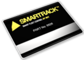
Part No: 6826 OPERATOR ACCESS CARD (HID PROX / HID ONLY)