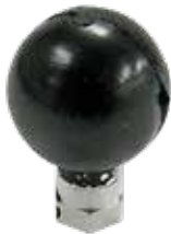
Part No: 8455 RAM BASE 1/4"-20 UNC FEMALE THREAD WITH HEX