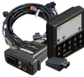
Part No: 15351 KIT GLOBAL LTE, HID DISPLAY, SHORT LOOM, 3M DISPLAY CABLE