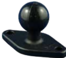
Part No: 15475 RAM BASE DIAMOND