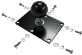
Part No: 8795 RAM BASE KIT TO SUIT MAXI VISION 5" & 7" MONITORS

RCT's fleet management system is the best in the market producing detailed automated reports to assist fleet managers and suppliers to continually improve operating KPI's.