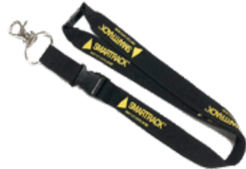
Part No: 16095 OPERATOR CARD LANYARD