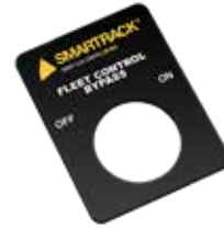
Part No: 10977 LABEL BYPASS SMARTRACK