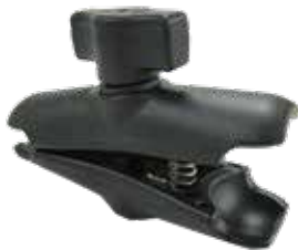
Part No: 8460 RAM DOUBLE SOCKET ARM 3"