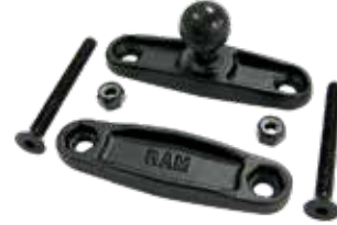
Part No: 9292 RAM BASE 3" CLAMP