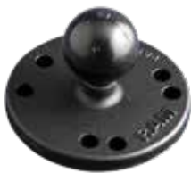
Part No: 8492 RAM BASE 2.5" DIAMETER ROUND