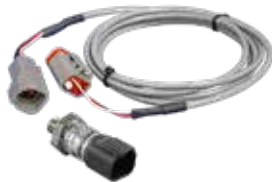
Part No: 15917 KIT SMARTRACK GLOBAL WEIGHT