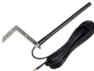
Part No: 16098 HI-GAIN GROUND INDEPENDENT ANTENNA