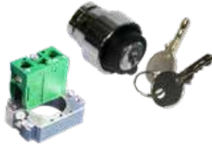
Part No: 15798 BYPASS SWITCH KIT