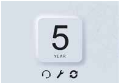
Part No: 12130 SUPPORT/ACCESS 5YR SMARTRACK