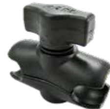
Part No: 8464 RAM DOUBLE SOCKET ARM 1 3/4"