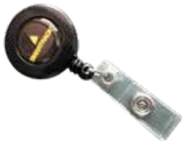
Part No: 16096 OPERATOR CARD RETRACTABLE LANYARD