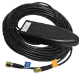
Part No: 10284 DUAL ANTENNA GSM & GPS