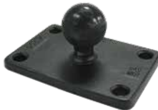
Part No: 8493 RAM BASE 2" X 3" UNIVERSAL RECTANGULAR