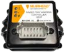
RAISE TRAY WARNING CONTROLLER 12729