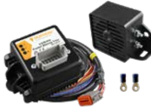
PRE-START WARNING TIMER KIT 12727