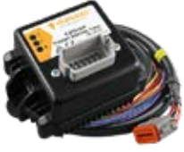
PRE-START WARNING TIMER 12728