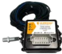
PARK BRAKE WARNING KIT, MULTI VOLTAGE, 1 DOOR ACCESS