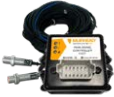
PARK BRAKE WARNING KIT, MULTI VOLTAGE, 2 DOOR ACCESS