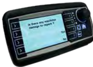
Part No: 12209 Description: VISUAL INTERFACE SMARTTRACK FMS