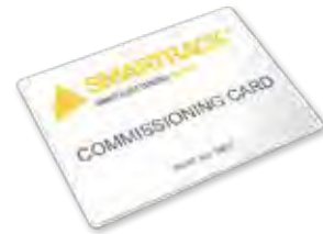
Part No: 6827 Description: FLEET MANAGEMENT DRIVER ACCESS SWIPE CARD