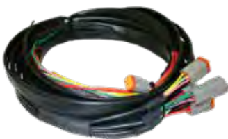
Part No: 10063 Description: FLEET MANAGEMENT MACHINE LOOM