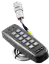
Part No: 7500 Description: FLEET MANAGEMENT DRIVER ACCESS KEYPAD