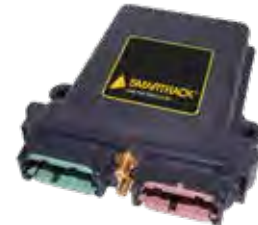
Part No: 10852 Description: CONTROLLER WIFI SMARTTRACK FMS