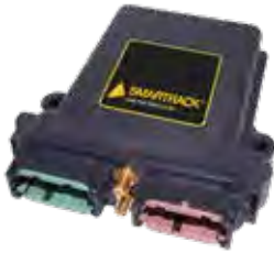
Part No: 8400 Description: FLEET MANAGEMENT CONTROLLER 12-48V

RCT's Fleet Management System is the best in the market, producing detailed automated reports to assist fleet managers and suppliers to continually improve key operating indicators.