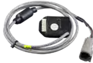
Part No: 5680 Description: FLEET MANAGEMENT IMPACT SENSOR