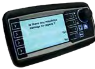
Part No: 11654 Description: FLEET MANAGEMENT DISPLAY 12V