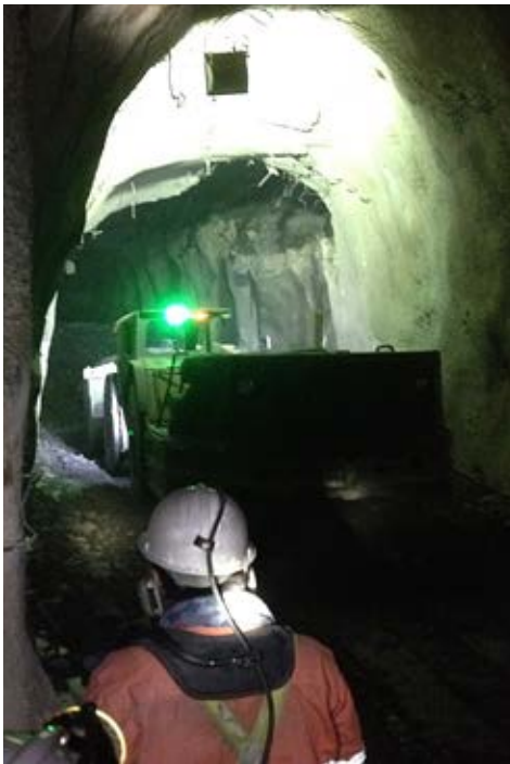
Remote control by Line-of-Sight of the underground loader