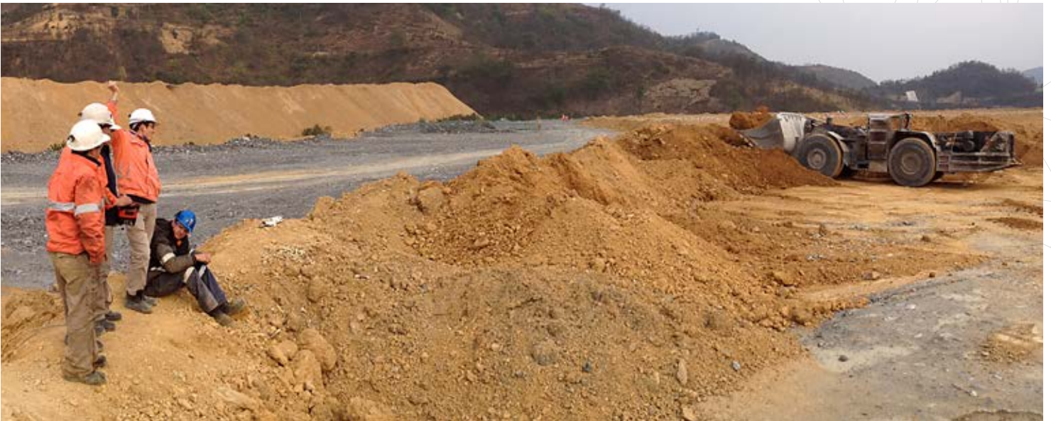
Training at Jinfeng Gold Mine